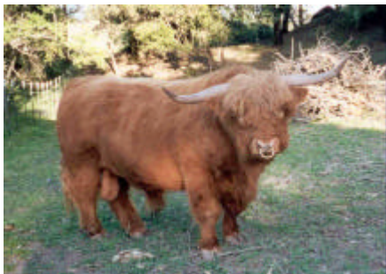
Scottish Highlander bull.

BACKUP! Members, we-re not talking about plain ol' McDonalds hamburger type cattle here. The scarfed down calves had mamas who are prized, big buck Scottish Highlander cows. Blue Ribbon, Best of Show desired cows. The calves would have easily brought $2,000 each!! No problem! An "unproven" bull goes for $5,000!!