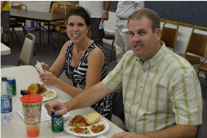
Good food and friends.