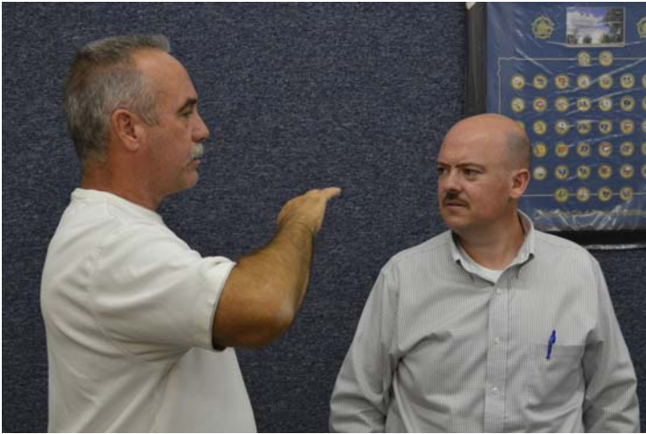
Sharing stories of the hunt.