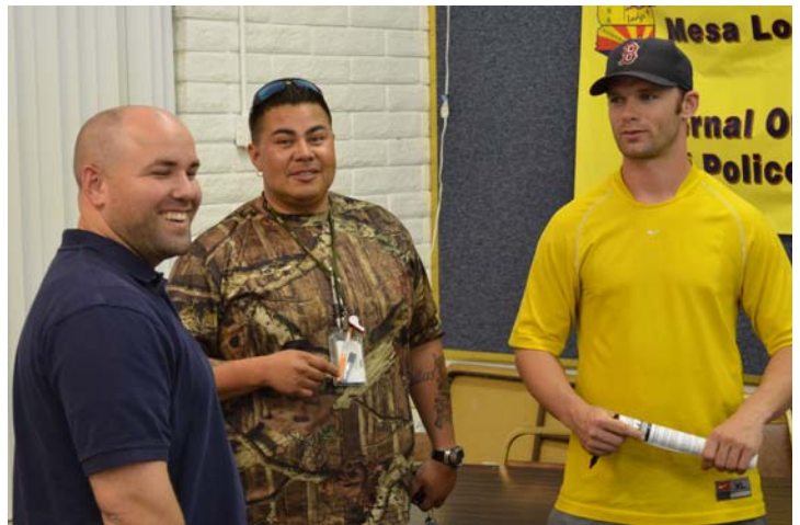
Meeting new and prospective members.