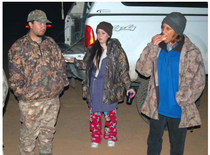
Some teams tried the new camo patterns now available.