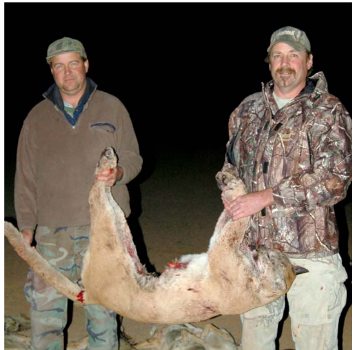
XPC members received 100 points for their mountain lion