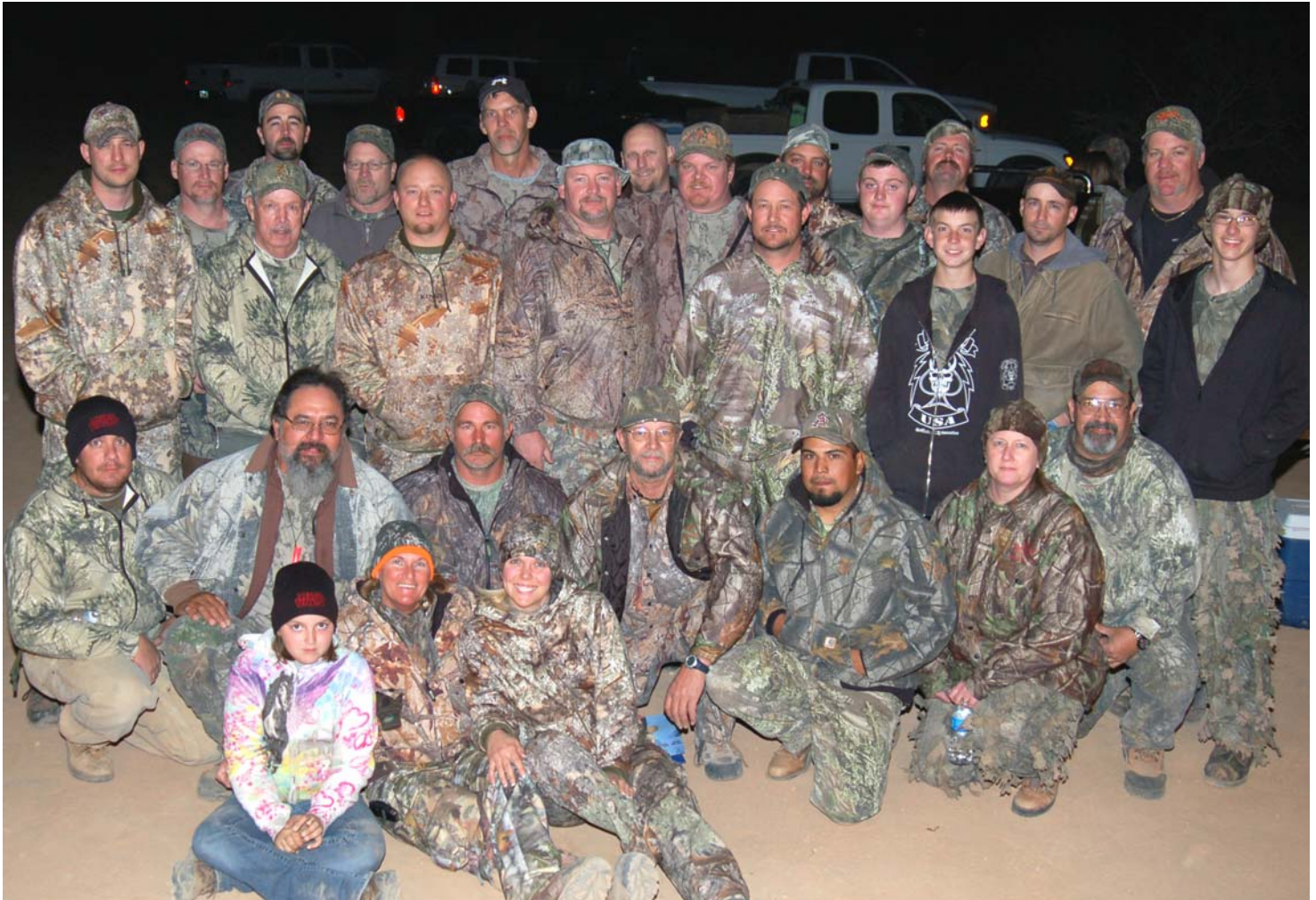
XPC took first place in the Multi-Club Hunt this year. As you can see from this photo, they were well represented.