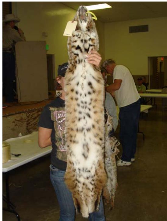
2012 ATA Fur Sale. This is an $800 Bobcat