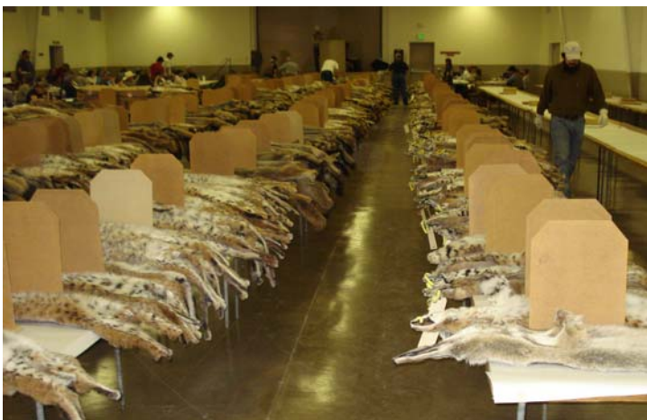
2012 ATA Fur Sale consignments