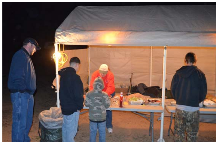
XPC members put on a great feed at check-in. The ladies of XPC seemed to have done most of the work. Excellent Job!!!!