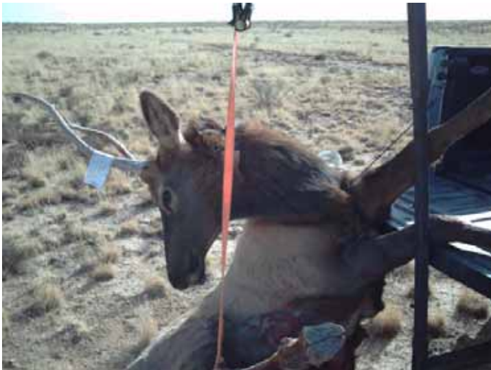
Craig's Baby Bull

I got in my truck, hi-tailed down the road going parallel for around a mile, and started to head them off on foot. This took about 45 minutes or so. I finally caught up to the four cows and 1 spike. They had no idea I was on them again, which by the way makes it way easier to make a good shot. I did fire once more and missed, but the good news was they came at a 45 degree angle towards me. I crawled on the ground, drew out my shooting sticks, and slowly stood up. There they were, just about 130 yds. to my left. When I looked in my scope, I expected to see the spike leading, but he was second in line. The lead cow was looking back, so I slowly scoped out the spike and placed a good shot to the rear of his ribs and going all the way to his neck. Eight seconds later, down it goes and all the work began. In realizing what I prayed for, it worked out just fine. As it was, this spike was quite enough to handle on my own without quartering it.