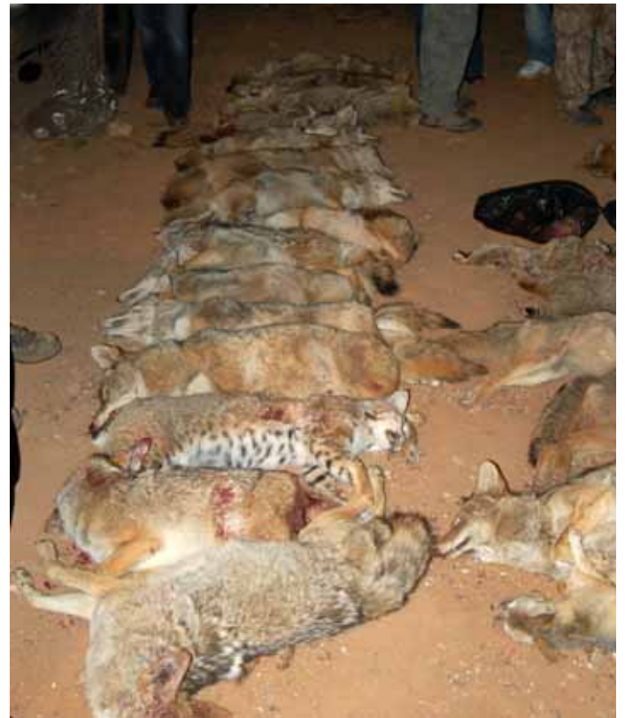
Coyotes and Bobcats harvested by the APC at the January 17th Multi-Club Hunt