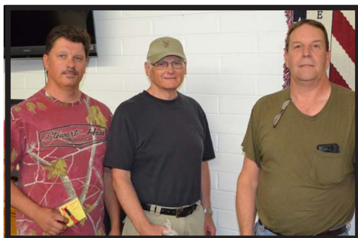
Door Prize Raffle winners