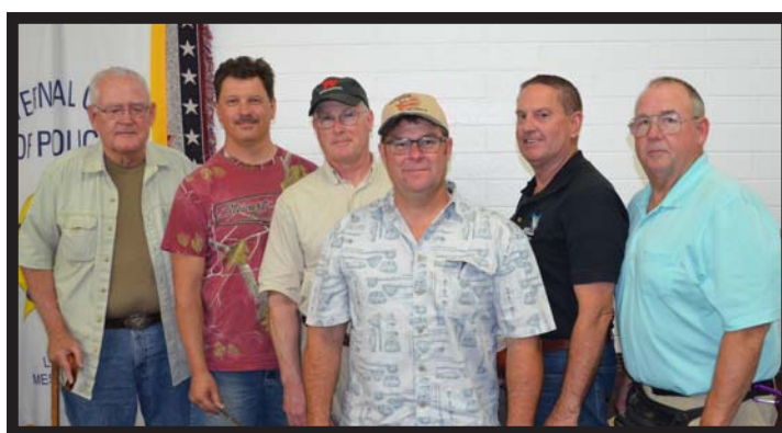
Raffle ticket drawing winners