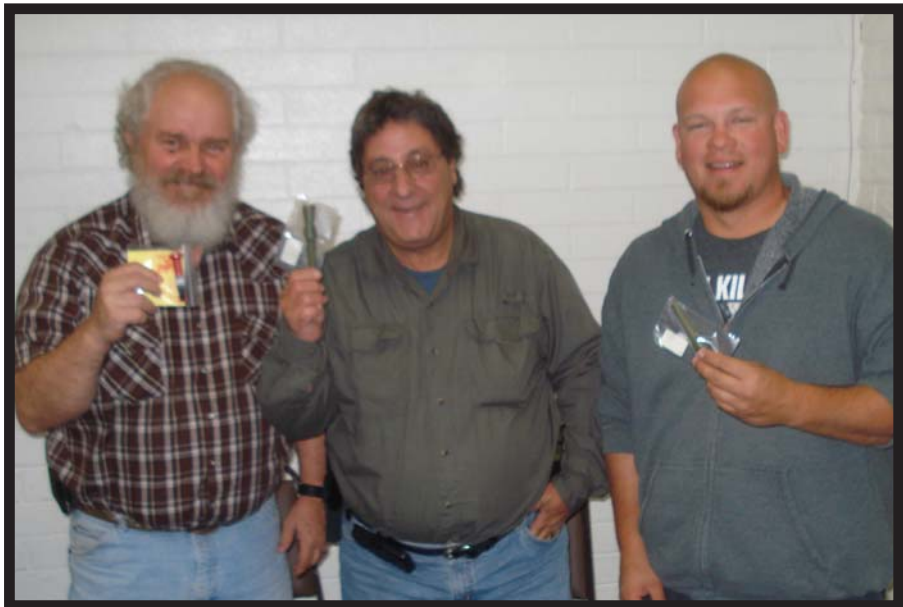
Door Prize Winners