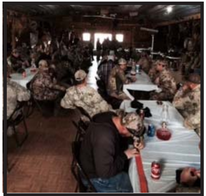
The Arizona Coyote Calling Championship check in and dinner.