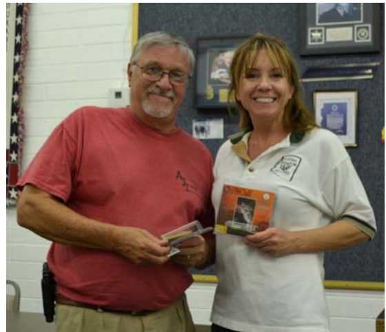
Door Prize Winners