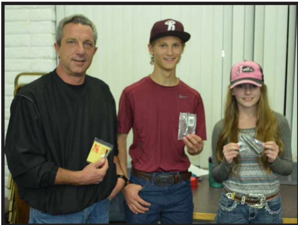
January Door Prize winners