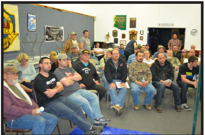
Some of the members watching the skinning and fur prep demonstration.