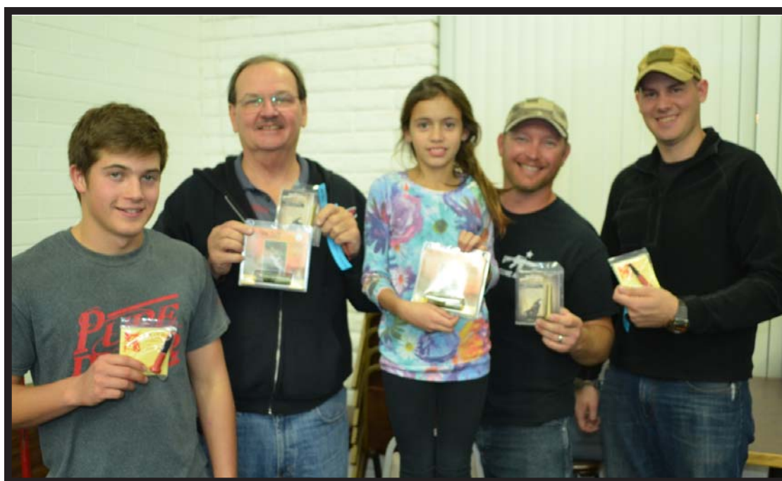
January Raffle winners