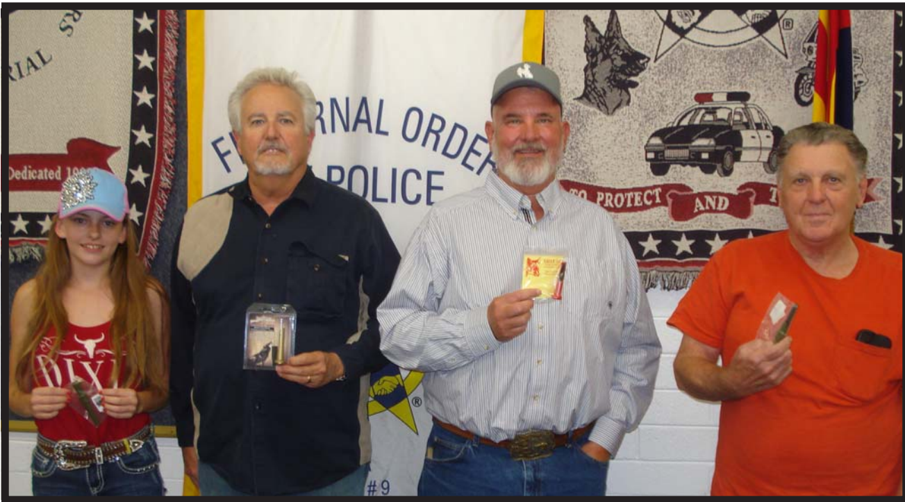
December Door Prize winners