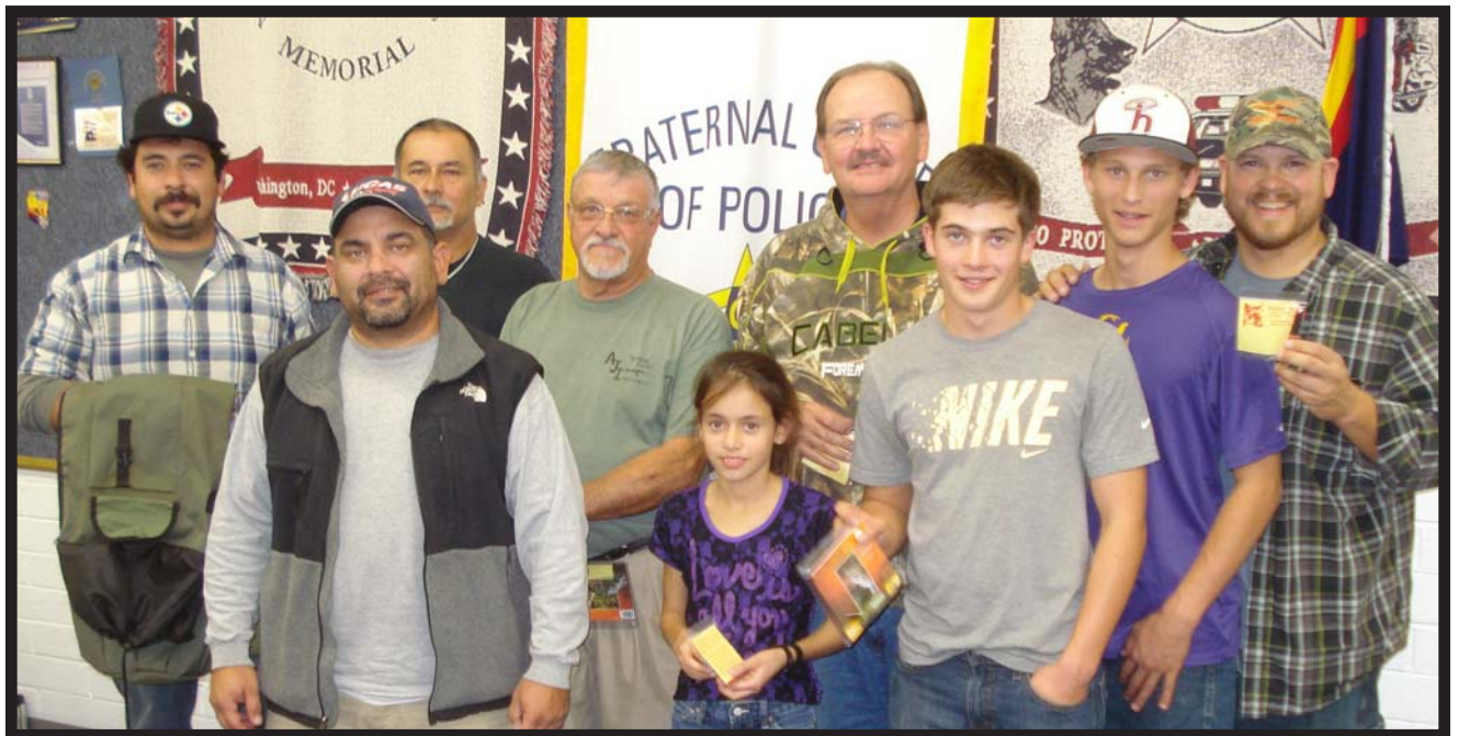
December Raffle winners