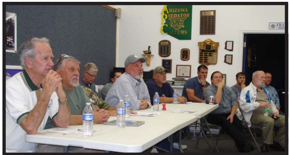
Some of the members listening to the guest speakers.