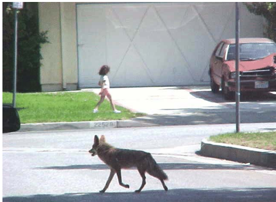
Figure 1. An urban coyote strolls through West Hills, a suburb of Los Angeles, California, in July 2002.

The typical activity pattern of coyotes in the absence of human harassment seems to be largely crepuscular and diurnal, but when predator control activities are undertaken, coyotes shift their activity mainly to nighttime to avoid humans (Kitchen et al. 2000). Conversely, a lack of human harassment coupled with a resource-rich environment that encourages coyotes to associate food with humans can result in coyotes losing their “normal” wariness of humans. Howell (1982:21) stated that this sort of environment, which had developed in hillside residential areas of Los Angeles County, produced “abnormal numbers of bold coyotes.” At that time, he noted it was not unusual for joggers, newspaper delivery persons, and other early risers to observe 1 to 6 coyotes daily in such residential areas. By the late 1990s, Baker noted that coyotes in this area commonly could be observed feeding in late mornings and afternoons, and residents saw coyotes in yards, on streets (Figure 1), and on parks and golf courses throughout the day (Baker and Timm 1998). More recently, coyotes have been observed during mid-day on school grounds. Such behavioral changes appear to be directly associated with increased attacks on humans.