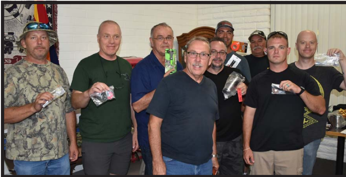
Door Prize Winners